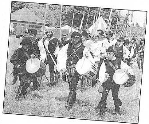
● RIGHT: the Stafford Household on the attack. CGPN1087H95N ● ABOVE: the Stafford Household on the march. CGPN 1089H95N