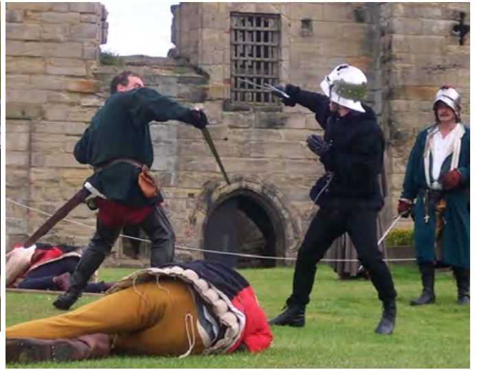
(Above and right) Preparing for battle, and the final stroke of justice.