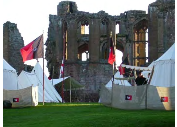
A few views around the camp.